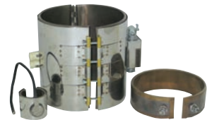
High Performance Heater