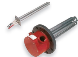
Immersion Heater Flange