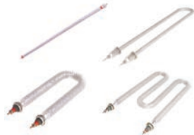
Tubular Heater and Fin Tubular