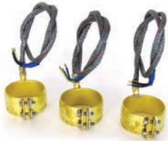
Moisture Proof Band Heater