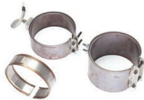
Power Band Heater