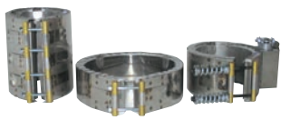
Ceramic Band Heater