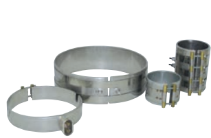
Mica Band Heater & Mica Strip Heater