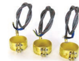
Moisture Proof Band Heater