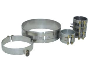
Mica Band Heater & Mica Strip Heater